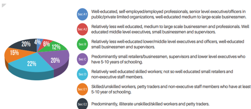
Fig 3: SEC Classification for the urban population of Pakistan (IPSO, 2014-2015: https://www.ipsos.com/sites/default/files/Consumer-Book-of-Pakistan-2014-15.pdf )

Capri felt that womens’ skin needs must be met through gentle care, and